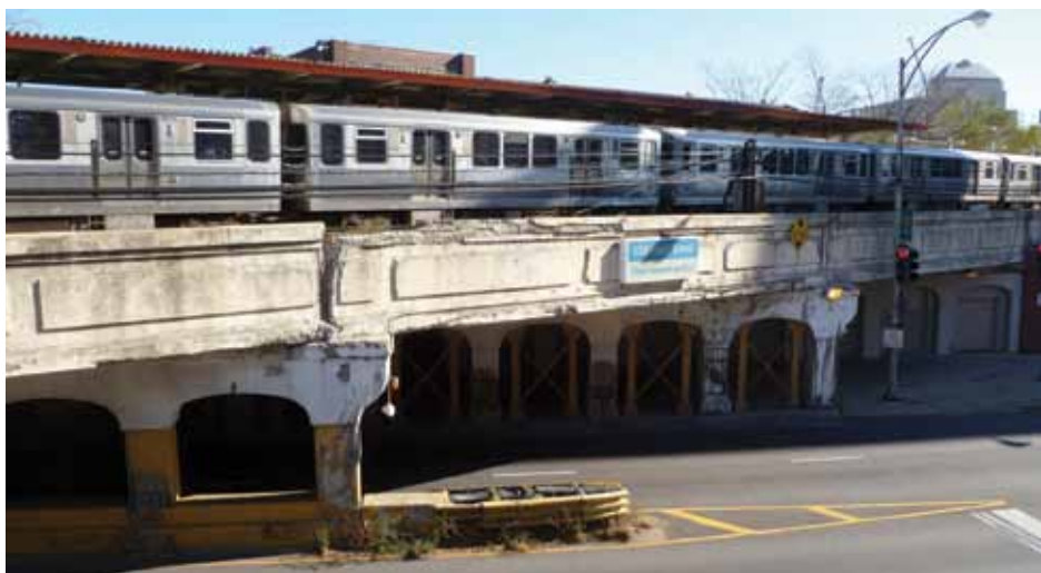
Figure 1: Corrosion-damaged concrete piles in Chicago being assisted with steel trusses.

That study, and many others that were conducted worldwide in the following years, have undeniably demonstrated the effectiveness of FRP in strengthening deteriorated columns. A large number of columns in buildings and bridges have been retrofitted with this technique worldwide. All those studies and field applications use the wet layup technique, whereby fabrics of carbon or glass are saturated with resin in the field and wrapped around the column. However, there are several shortcomings with that technique. The flexibility of the fabric requires that the surface of the host structure be repaired to a smooth surface before the fabric can be wrapped onto the column. This prolongs the repair time. Similarly, the flexible fabric cannot