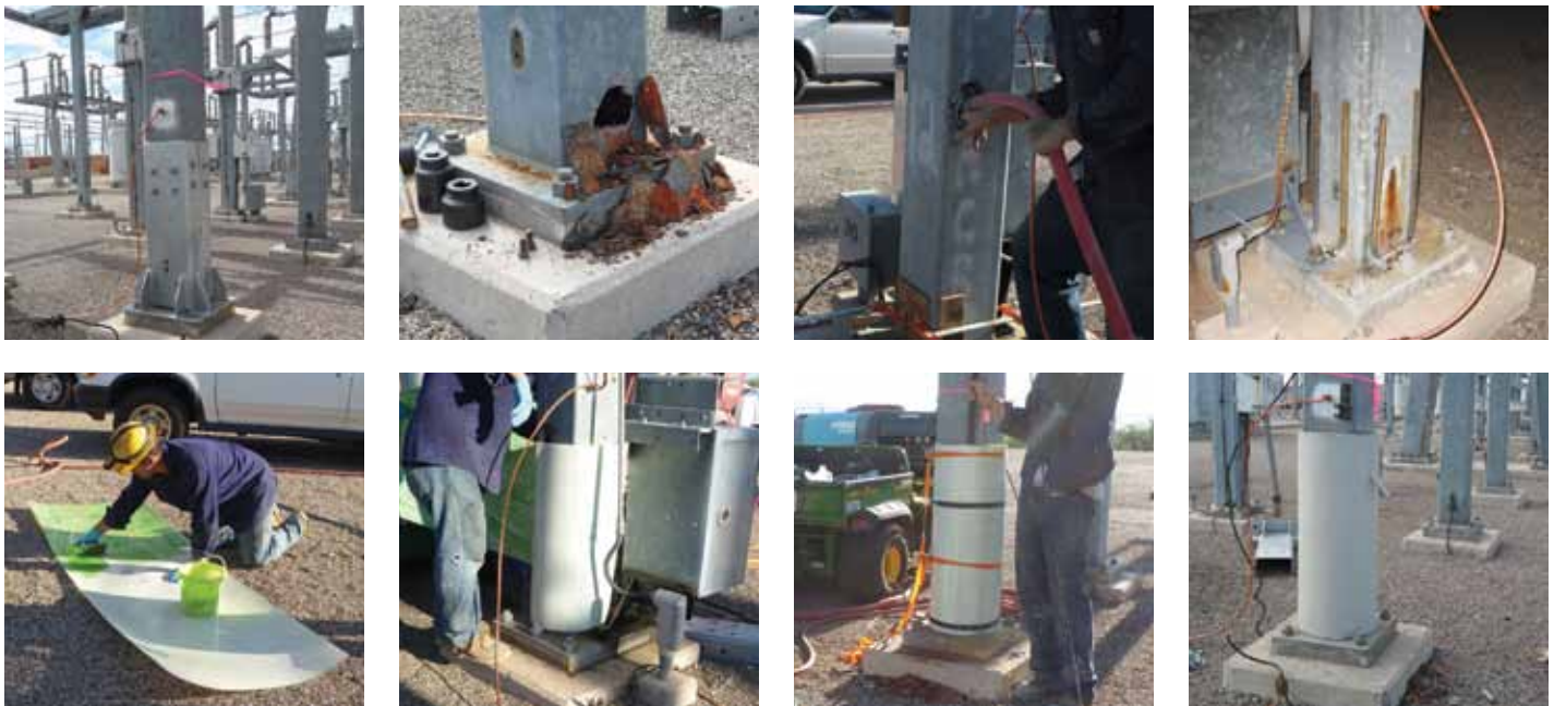
Figure 3: Repair of steel poles at TEP substations: original repair concept; corroded pole; filling the pole with grout; reinforcing steel welded to base plate; applying epoxy to the laminate, wrapping it around the pole and holding it with straps while grout is placed; finished and painted jacket.

the pile. The magnitude of this confining pressure depends on the strength of the laminates and the number of plies that are incorporated in forming the shell in the field. For example, if a concrete pile constructed with 4000 psi concrete is encased in a laminate jacket that offers a confining pressure of 600 psi, the confinement results in a rise of concrete compressive strength from 4000 psi to 6600 psi.