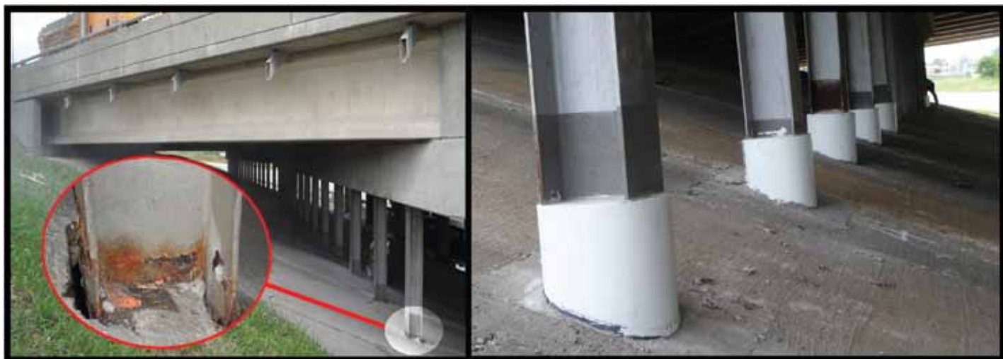
Figure 4: The I-70/I-270 interchanges in St. Louis, MO where 49 corroded bridge piling were recently repaired with FRP laminates.

Due to its dielectric properties, a glass laminate with tensile strength of 62000 psi and thickness of 0.026 inch was used. A 3-foot wide x 8.5-foot long piece of laminate was used for each structure. A special two-component epoxy was mixed in the field and applied to an approximately 5-foot long section of the laminate. The mixed epoxy has a paste-like consistency and is applied with a trowel to a thickness of 20-30 mil. The laminate is then wrapped loosely around the structure to create a two-ply shell. The 8.5-foot length of the laminate allows creation of a two-ply 15-inch diameter shell with 8 inches of overlap beyond the starting point.