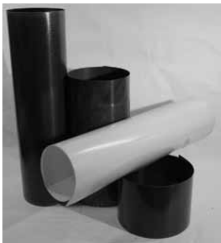
Figure 2: Carbon and glass FRP laminates.

To overcome the above shortcomings, a new form of FRP laminate has been developed (Ehsani, 2010). During the manufacturing process, one or more layers of carbon or glass fabric are saturated with resin and subjected to heat and pressure to construct pre-cured laminate sheets as thin as 0.01 inches. The precision required to produce such a thin laminate was one that was finally achieved after an extended R&D process.