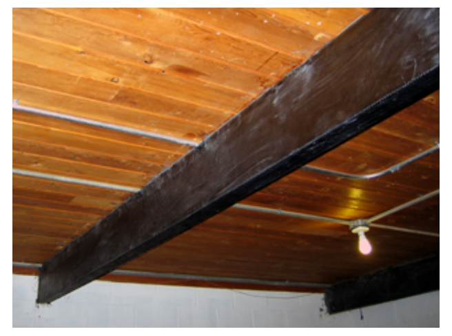
A retrofitted beam in the Coolidge Roundhouse gym is fully encased with a carbon-fiber covering.