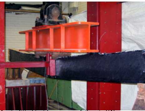
A retrofitted test beam nears failure in UA's Structural Engineering Laboratory.

Ehsani and Palmer tested wooden beams similar to those used in the Coolidge gym, and used strain gauges to measure forces. The gauges were mounted on an unmodified beam and on a second beam reinforced with FRP materials. They found that the reinforced beam was 67 percent stronger than the unmodified one.